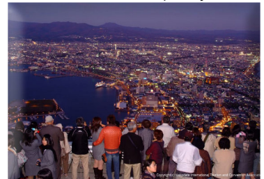
The Main Observation Deck