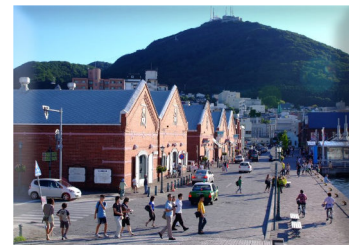
Kanemori Red Brick Warehouses