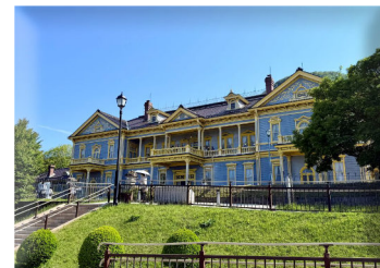
Old Public Hall of Hakodate Ward