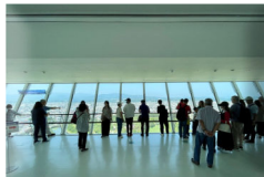
The Tower's Observation Deck